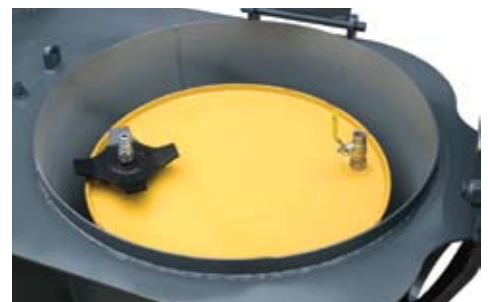
Screw In Dip Tube & Breather Valve Fitted