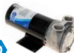
Hydraulic Oil Transfer Pump