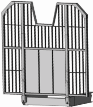
Headboard With Crane Cut Out