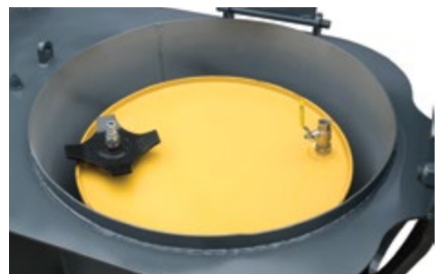
Screw In Dip Tube & Breather Valve Fitted