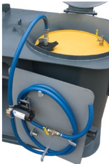
Pump System Connected To Drum