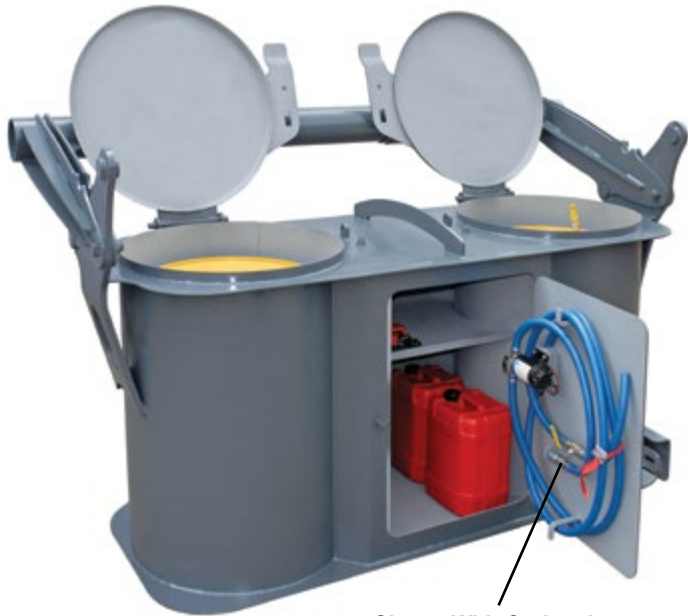
Shown With Optional Gear Pump System For Pumping Chain Oil