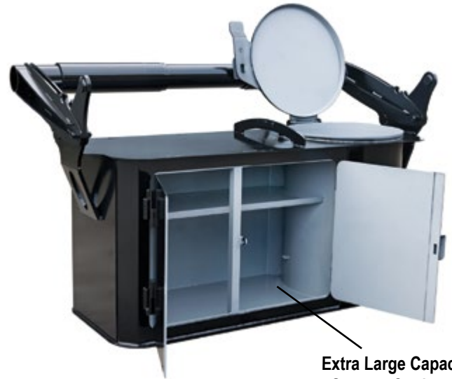
Extra Large Capacity Storage Cupboard