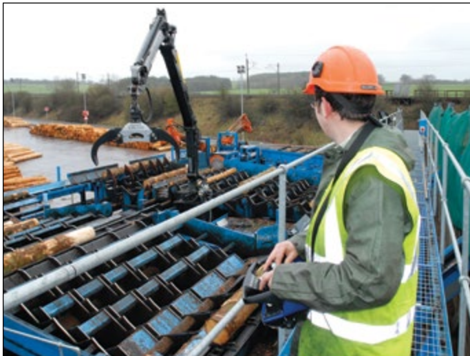
Wireless Remote Crane Operation