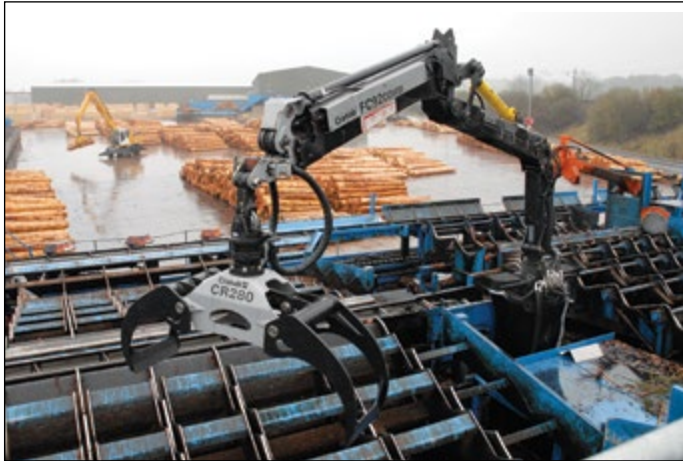
Static Mounted Crane on Sawmill Log Line

Cranab offer an extensive range of cranes for static mount materials handling with reaches from 4.75 to 10 metres and lifting capacities of up to 1250kg at 8.5 metres reach. Cranab cranes are designed to 85 cycle standard, the highest for forest cranes and can be used for 100% duty cycle. A wide range of log and materials handling grabs and attachments can be used with Cranab cranes for all types of handling operations. Cranab cranes are today in worldwide use in sawmills and recycling stations.